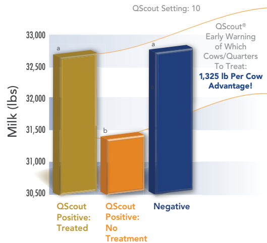
Figure 2. Treating subclinical mastitis presents a milk production advantage.

a,b Values with different letters differ, P = 0.0010 November, 2014 DHIA